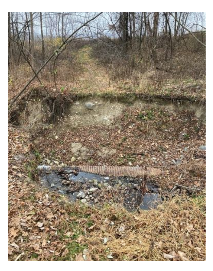
Damaged culvert on Dagmar Dale trail

The Refuge, along with our partners at the Federal Lands Highway Division of the Highway Administration, received funding to repair portions of the Liberty Loop, Dagmar Dale and Winding Waters nature trails. The proposed repairs on the Dagmar Dale Nature trail will involve replacing failed culverts which cross under the trail, resurfacing and regrading damaged portions of the trail surface, and installing confinement systems along trail soft spots. Repairs on the Liberty Loop Trail will involve deep patch repairs of trail side slopes, installation of a cellular confinement system, repair and rehabilitation of the trail surface, and turf re-establishment. Where segments of the Winding Waters Trail embankment eroded into the river, work will involve rehabilitating and resurfacing impacted portions of the trail surface and turf re-establishment. All proposed work would occur within areas previously disturbed by the original construction of each trail.