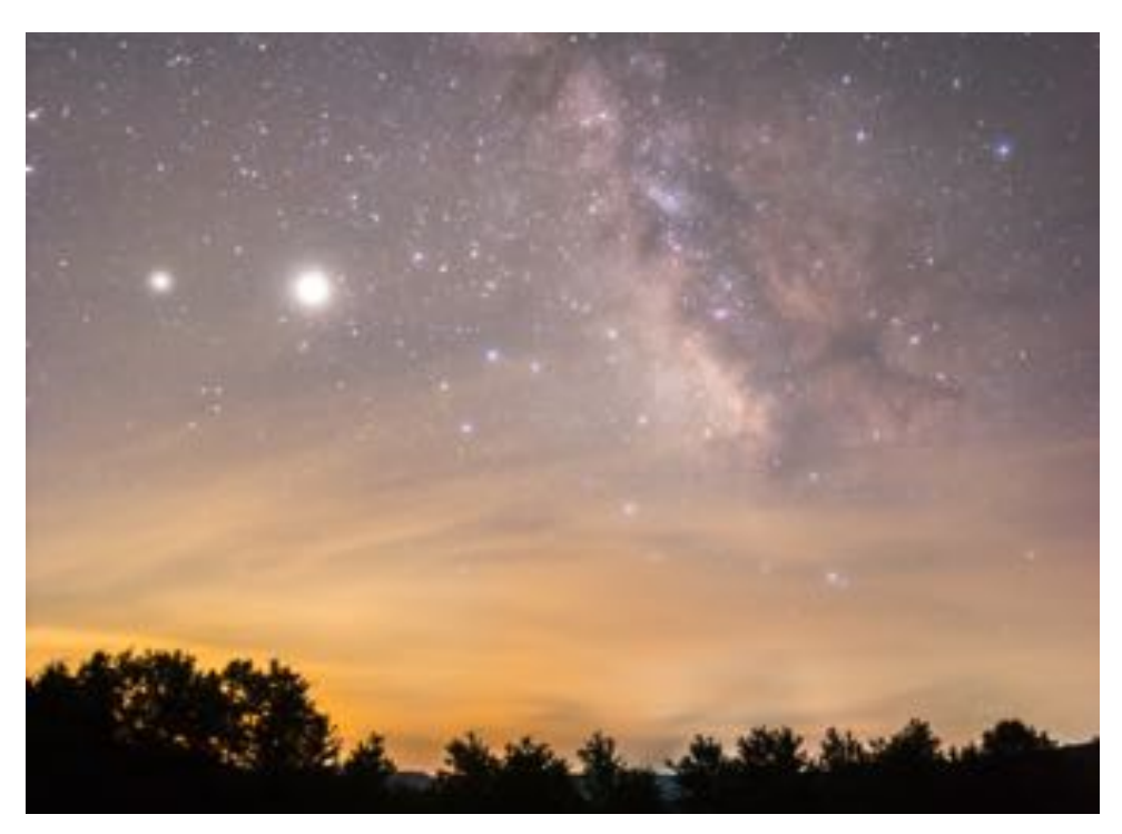
Night Sky

We would welcome additional volunteers to focus a telescope on features of the night sky. The group will train volunteers in how to use a telescope and teach them interesting objects that can be seen in the night sky that are visible during the different seasons. This will include constellations, the Moon, the planets, double stars, star clusters galaxies and nebulae