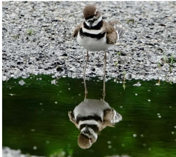
Camera Wildlife