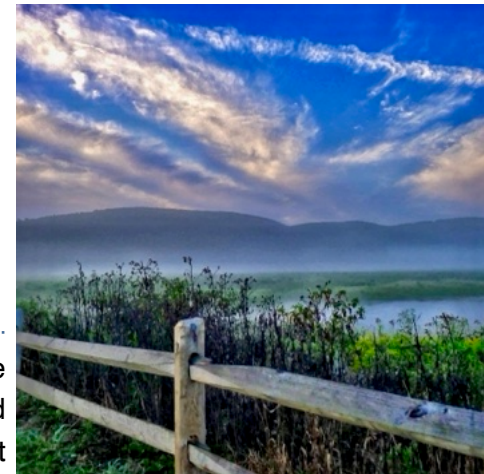
Cell Phone Landscape by Lorraine Trestka