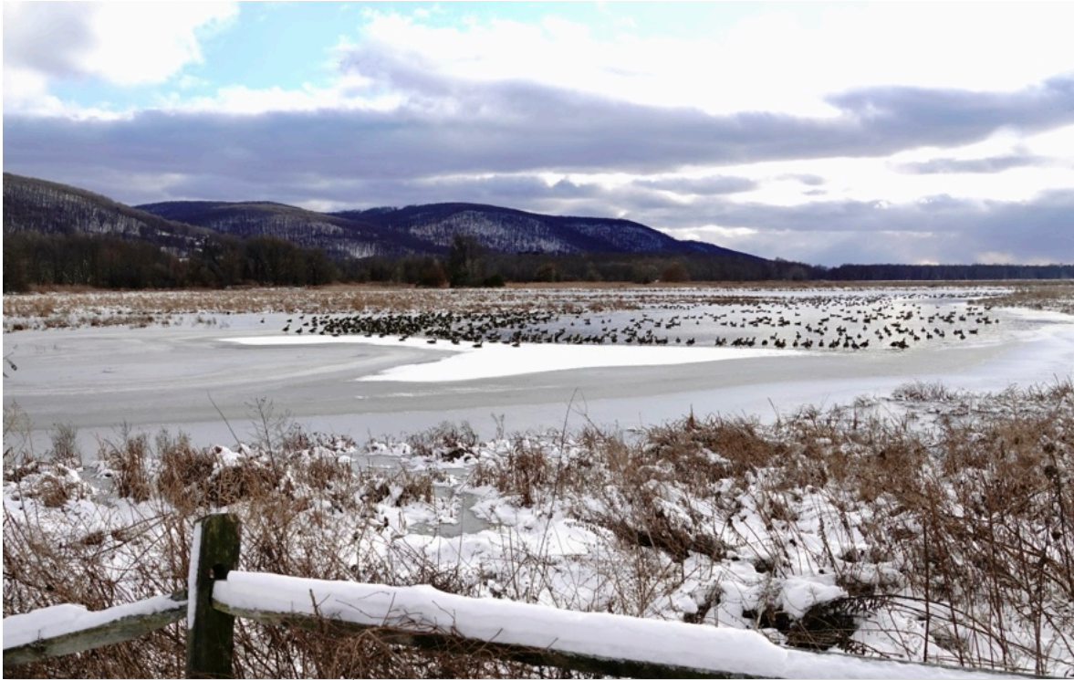
Liberty Marsh