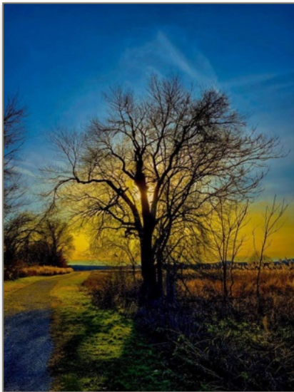
Camera Landscape

Pictured on this page are the first place winners in the four categories of this past year's photo contest. The annual contest invites all to submit their digital photos taken anywhere in the Wallkill River National Wildlife Refuge.